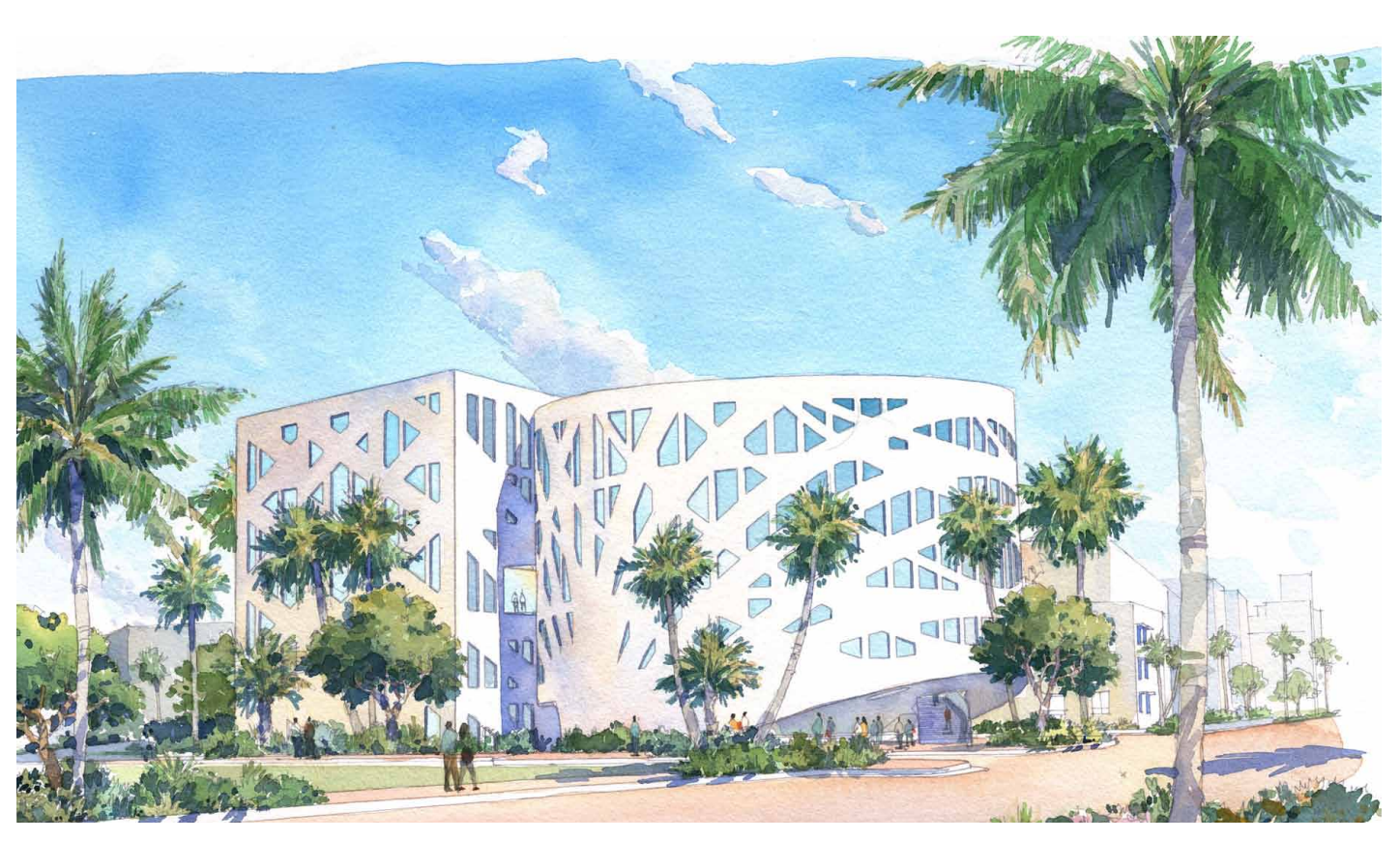
Faena Arts Center. Artist Rendering.