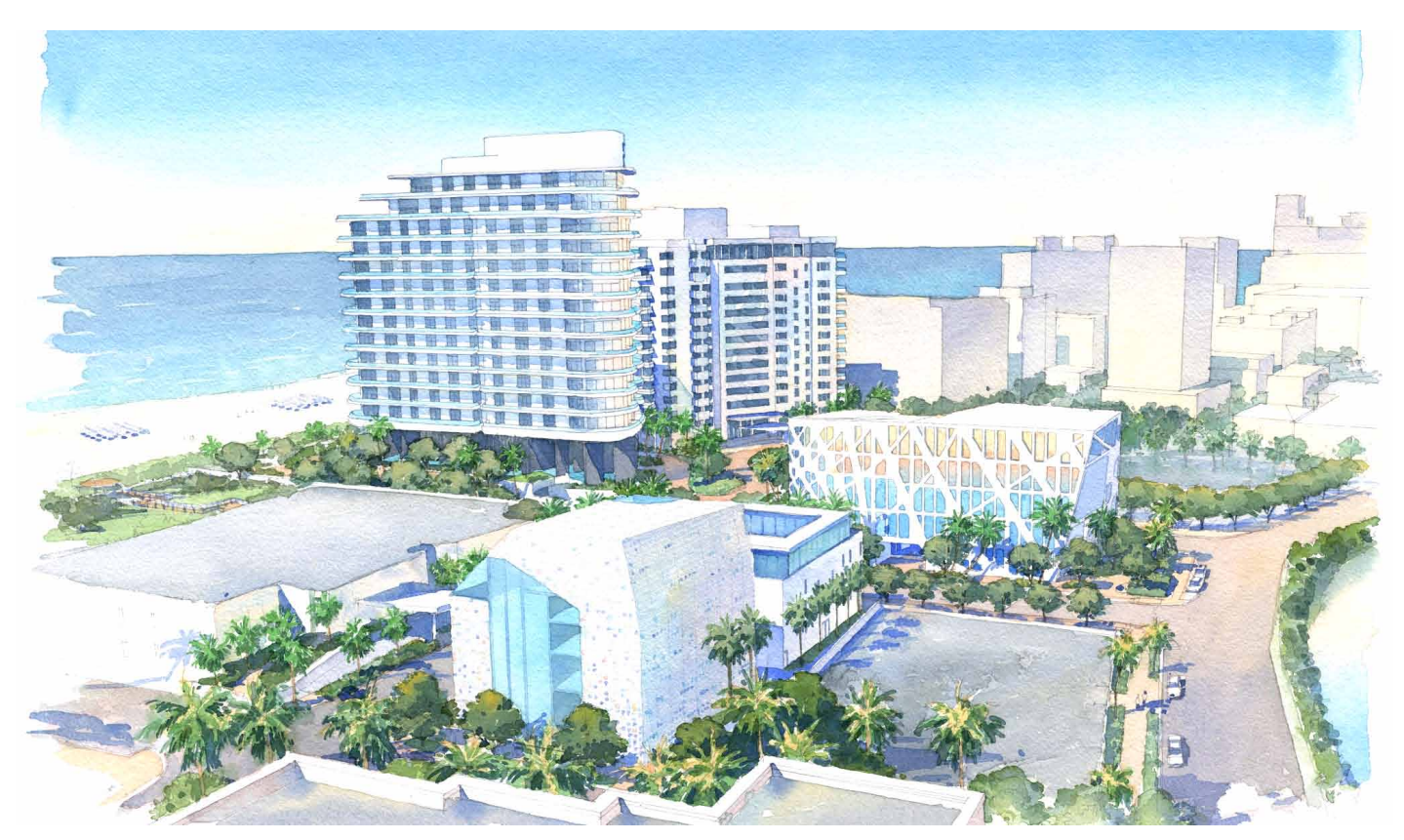
Looking south towards Faena District. Artist Rendering.