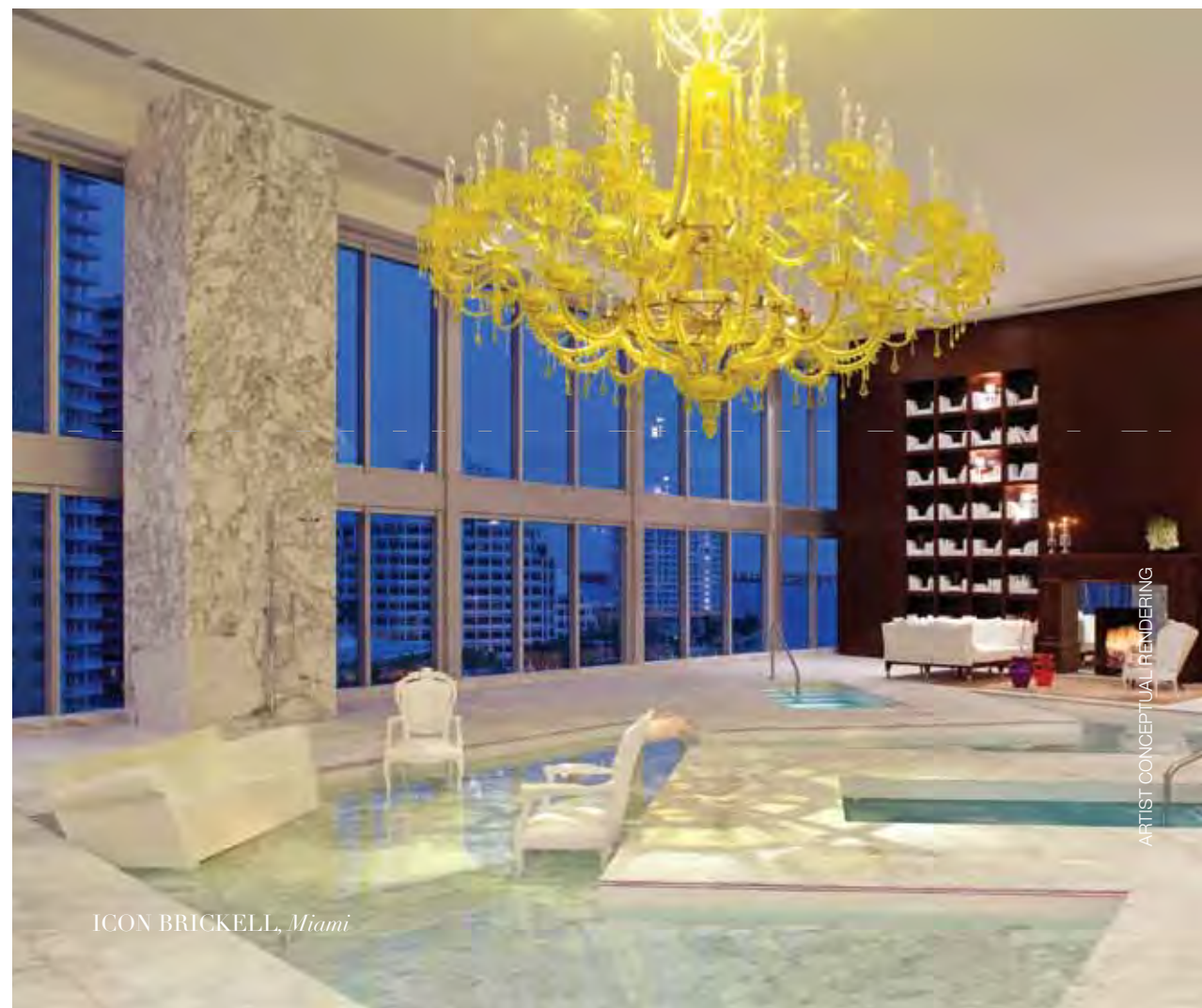
ICON BRICKELL, Miami