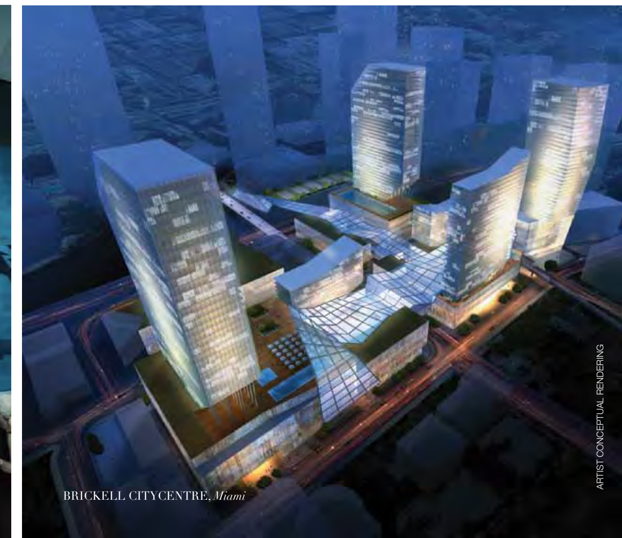
BRICKELL CITYCENTRE, Miami