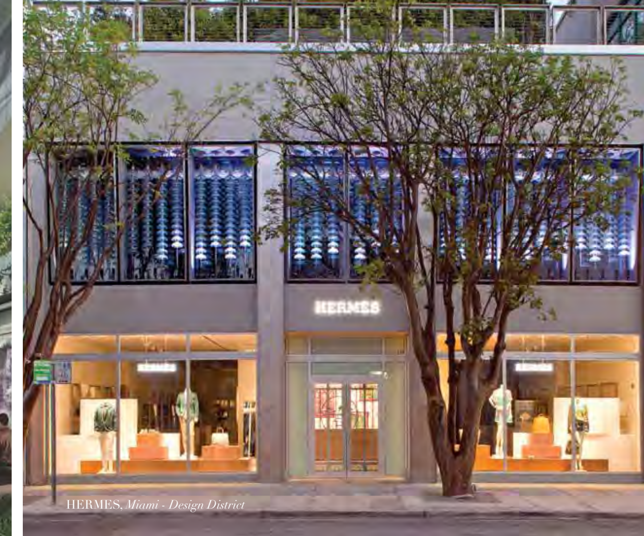
HERMÈS, Miami - Design District