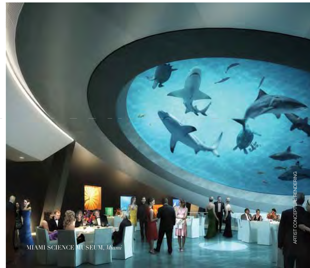
MIAMI SCIENCE MUSEUM, Miami