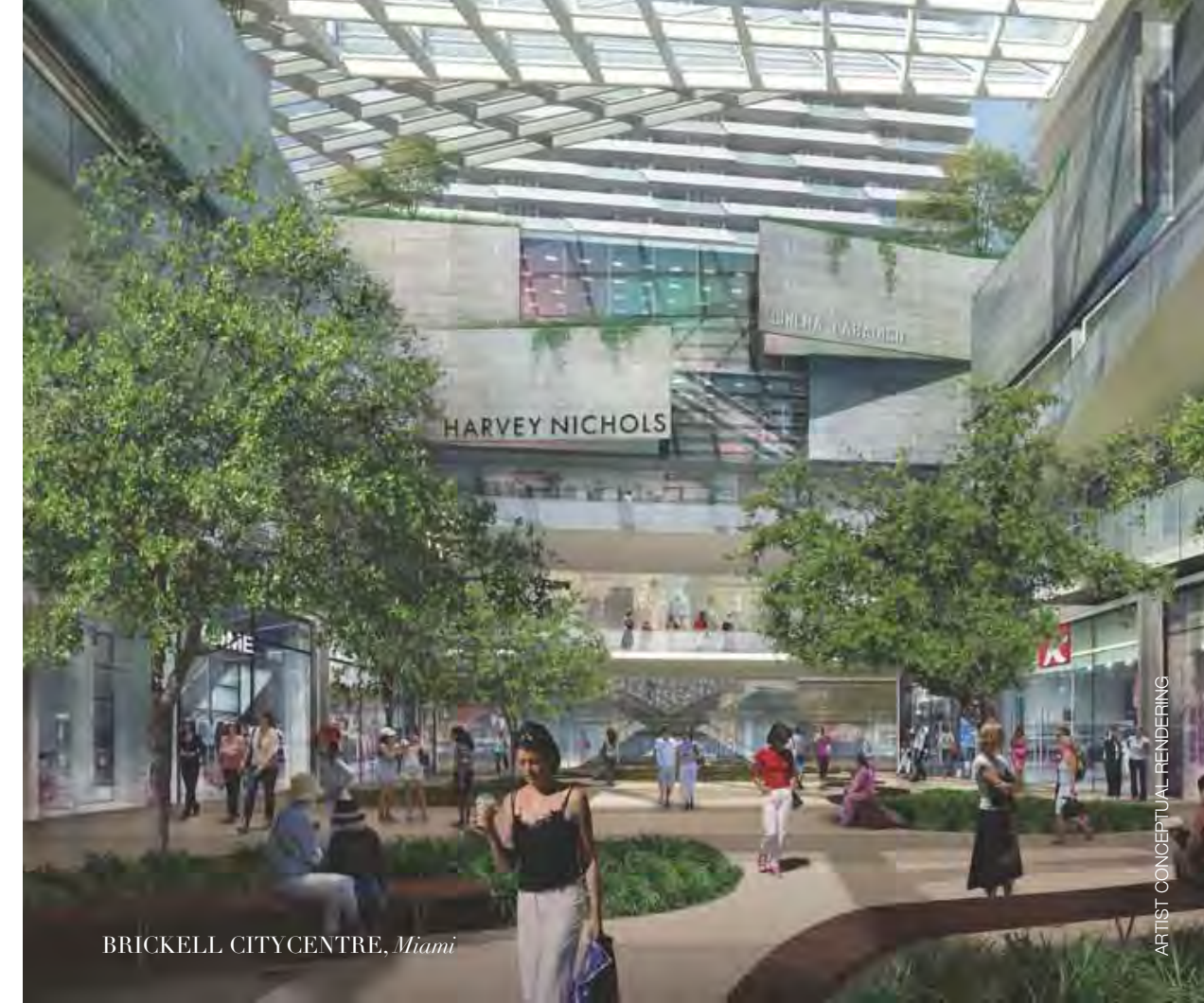
BRICKELL CITYCENTRE, Miami