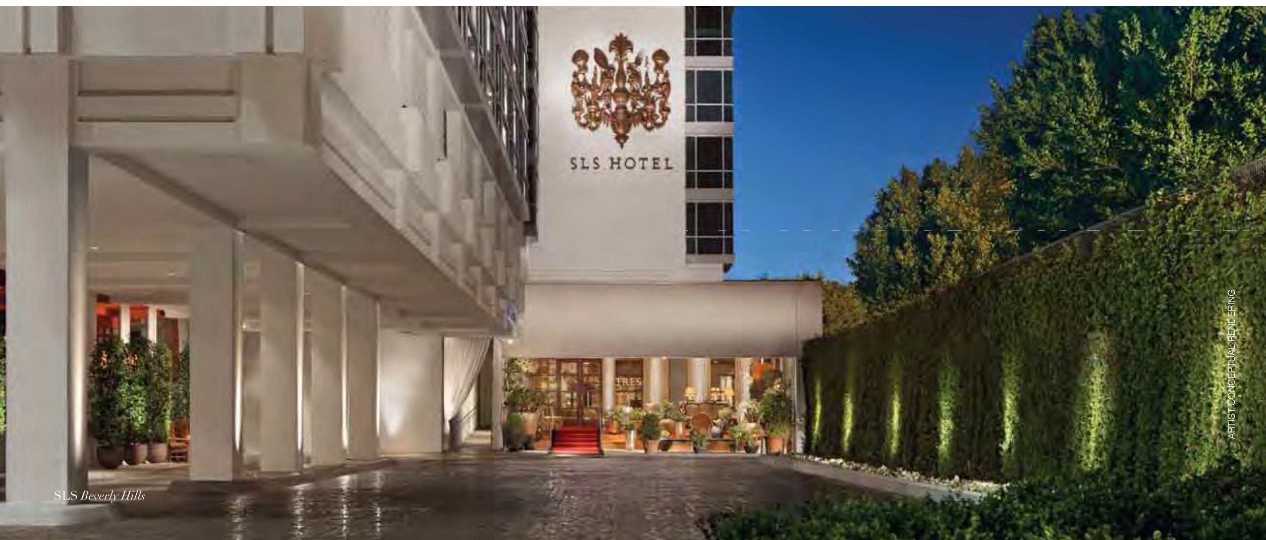
SLS Beverly Hills