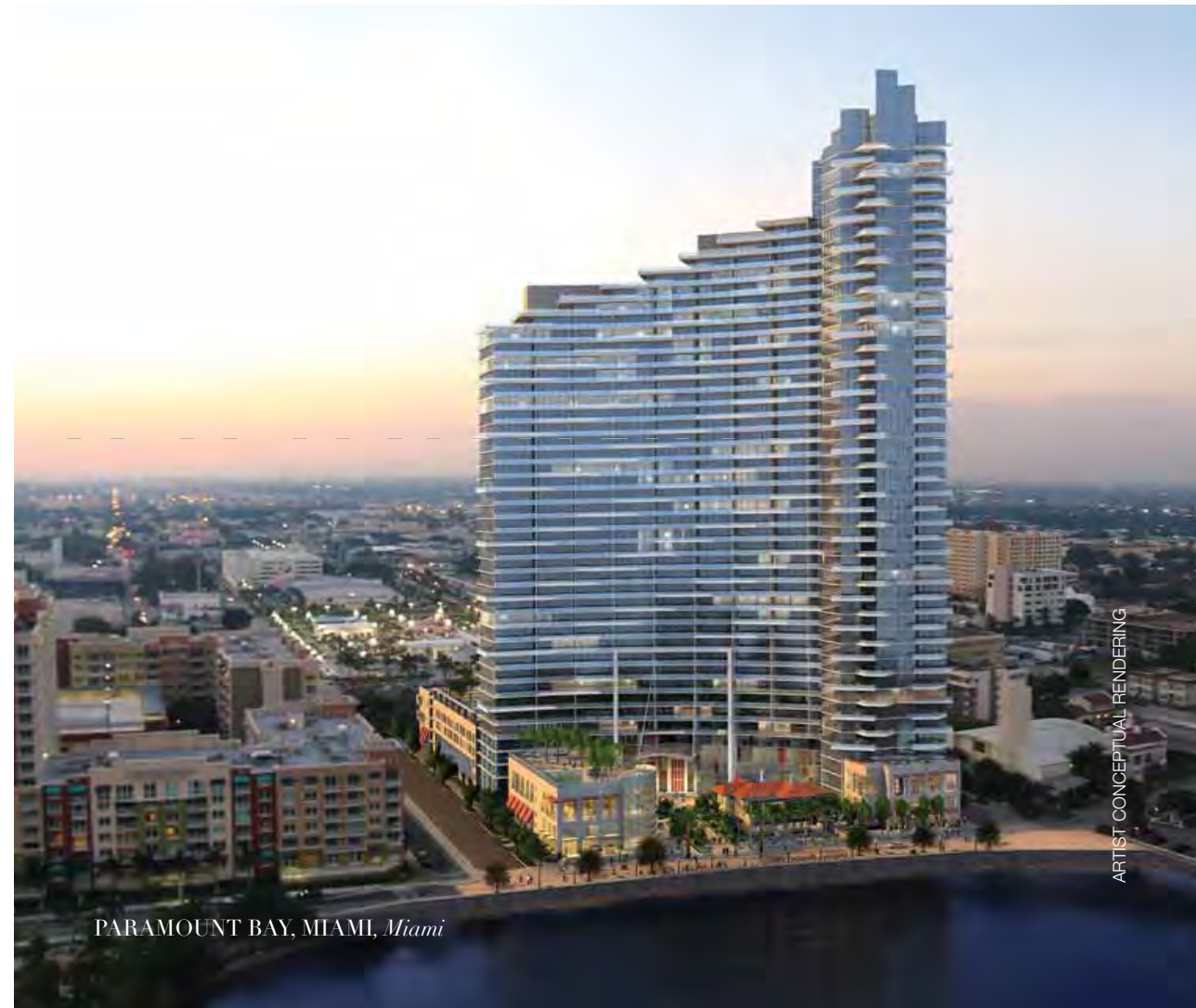
PARAMOUNT BAY, MIAMI, Miami