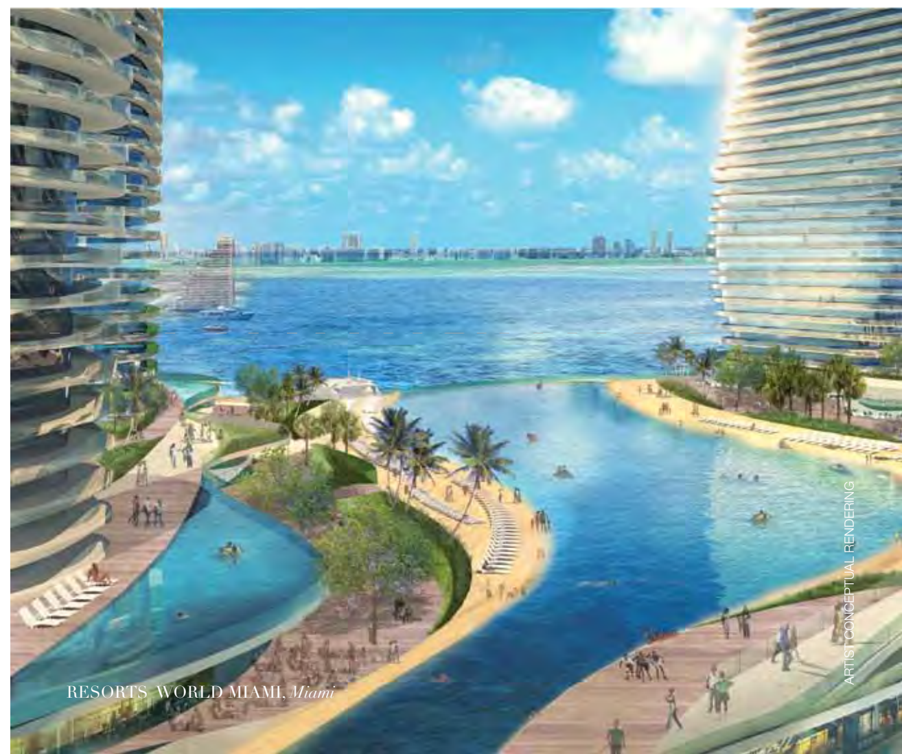
RESORTS WORLD MIAMI, Miami