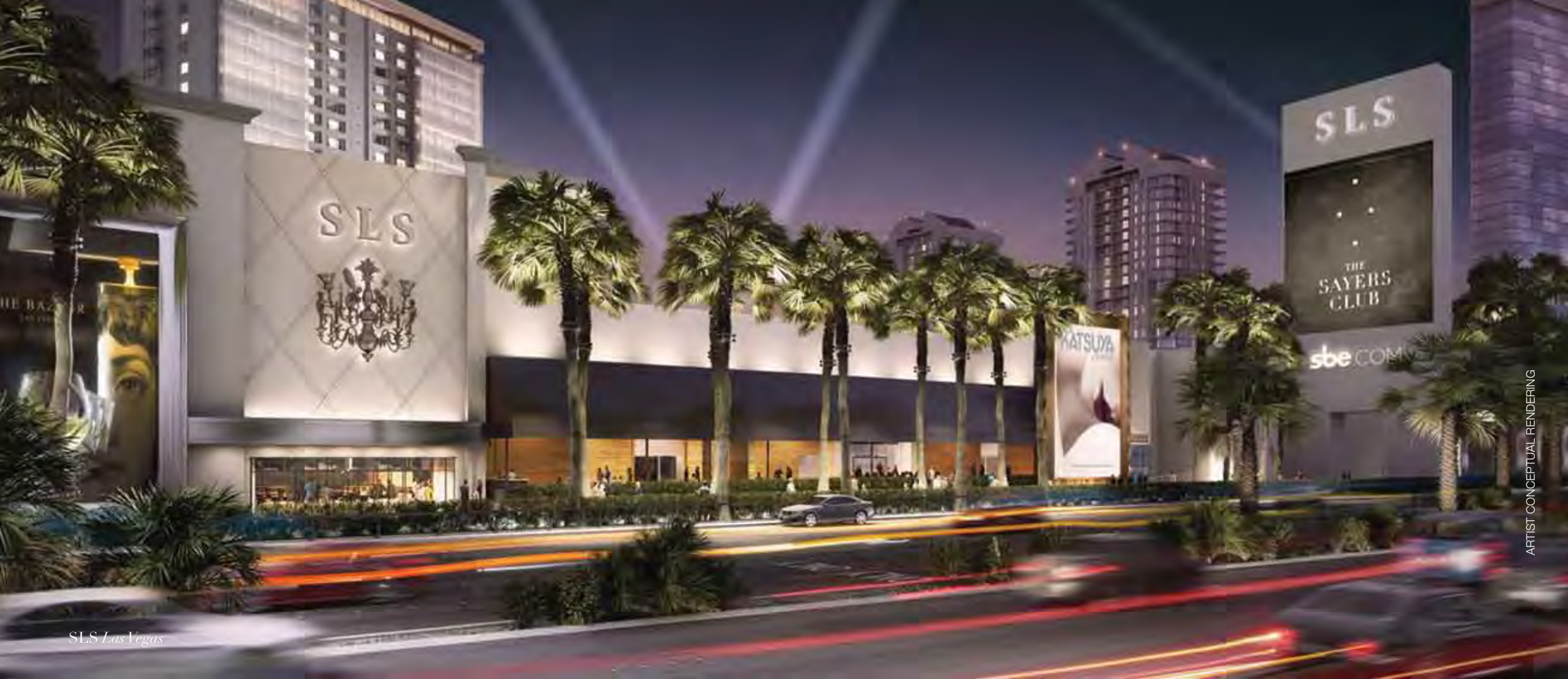
SLS Las Vegas