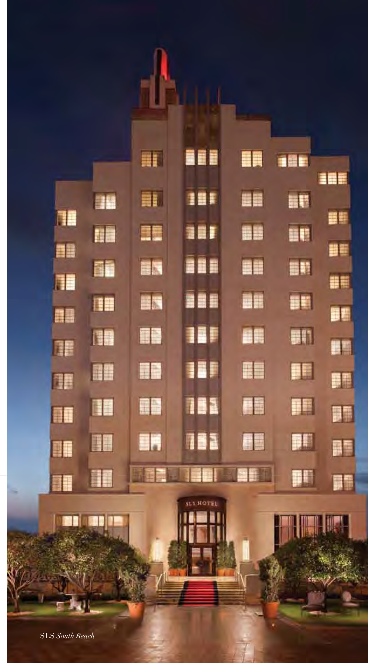
SLS South Beach

“SLS HAS HAD AN UNDENIABLE IMPACT ON HOSPITALITY WITH A ‘NEW IDEA’ THAT SPEAKS TO A GLOBAL COMMUNITY.