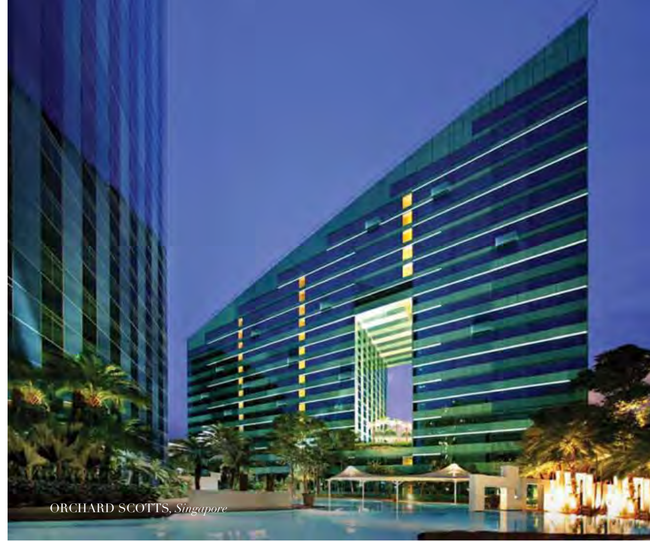
ORCHARD SCOTTS, Singapore