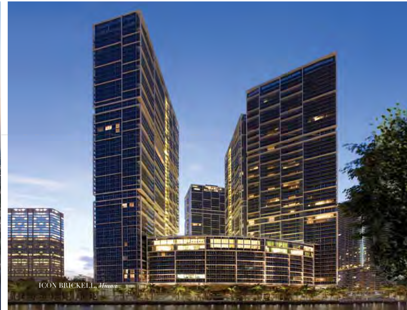
ICON BRICKELL, Miami