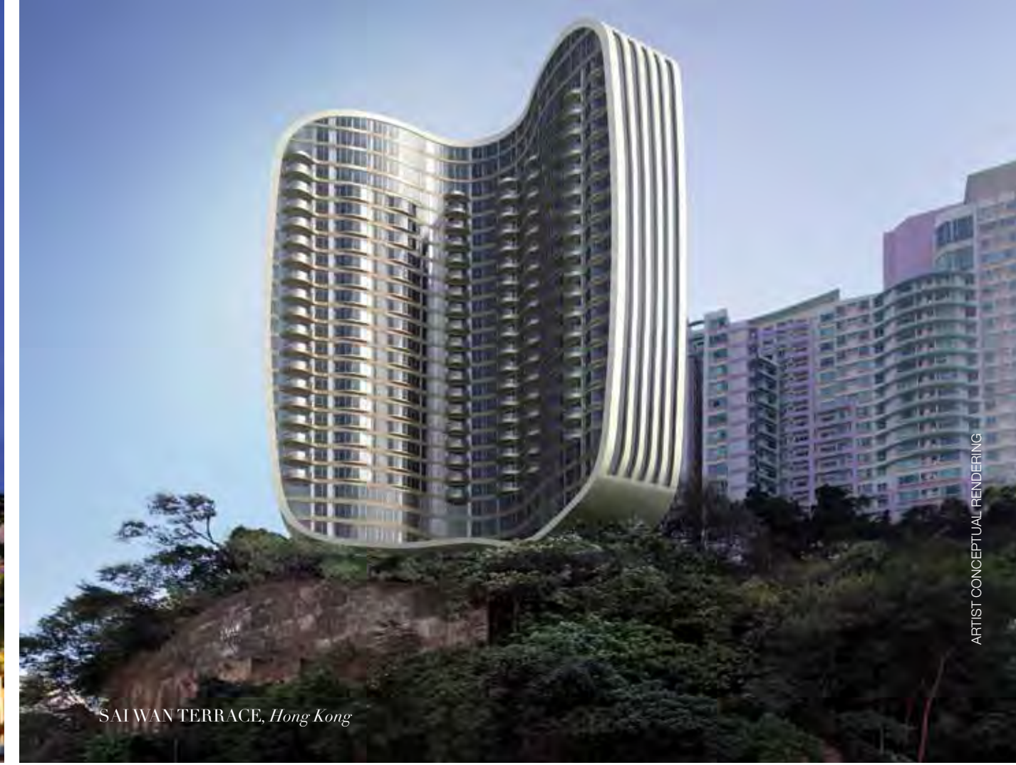
SAI WAN TERRACE, Hong Kong