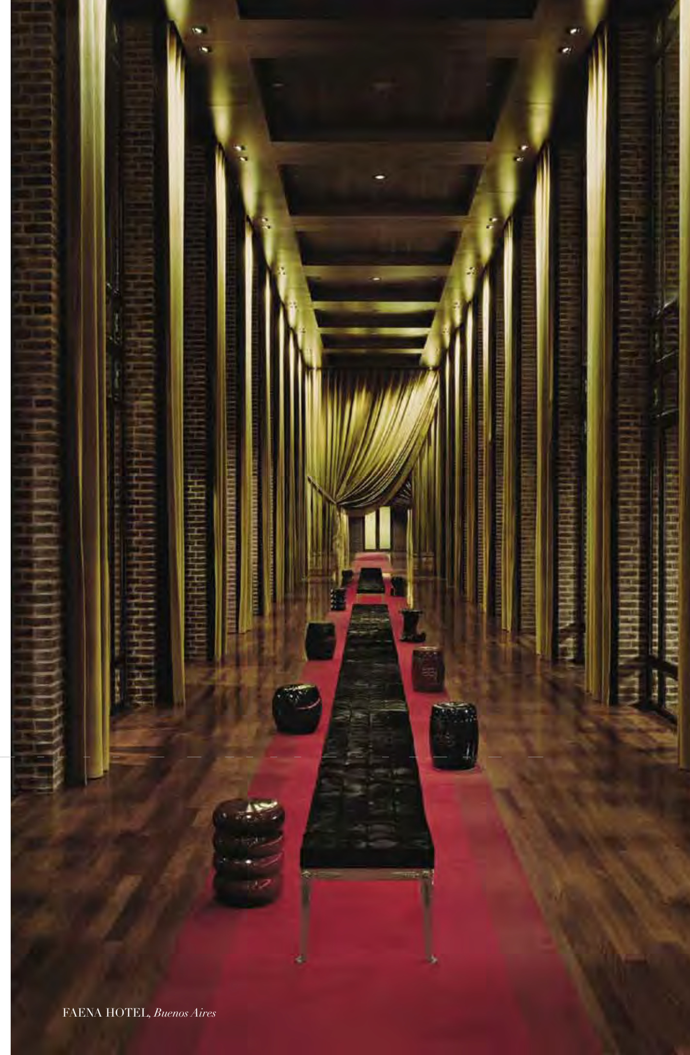
FAENA HOTEL, Buenos Aires