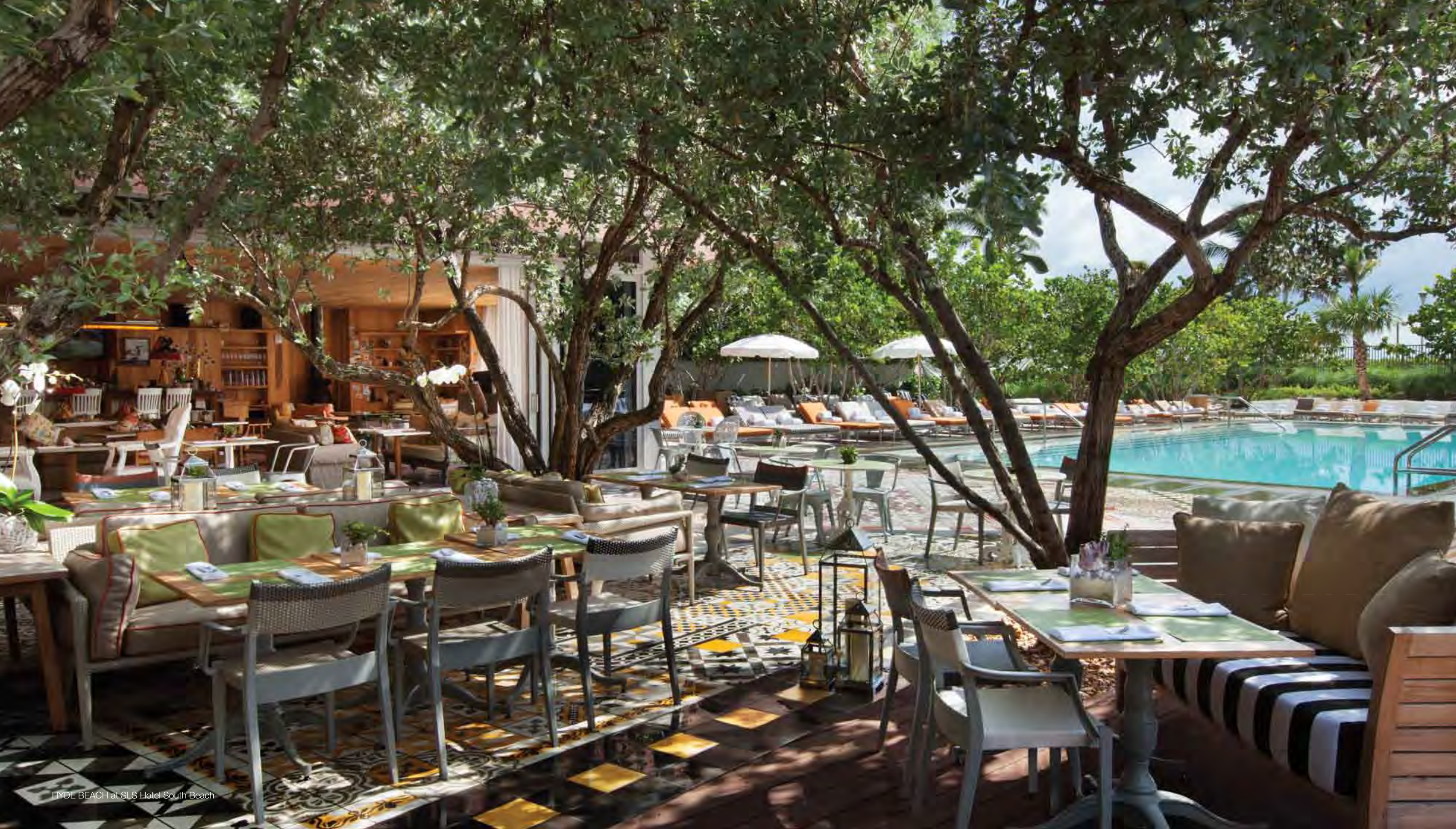
HYDE BEACH at SLS Hotel South Beach