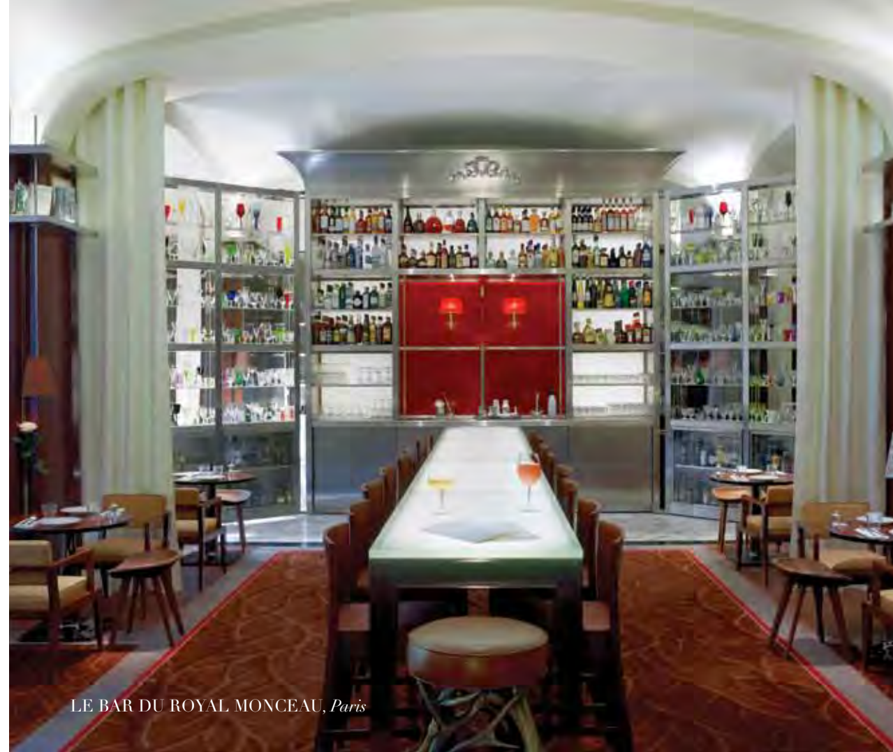
LE BAR DU ROYAL MONCEAU, Paris