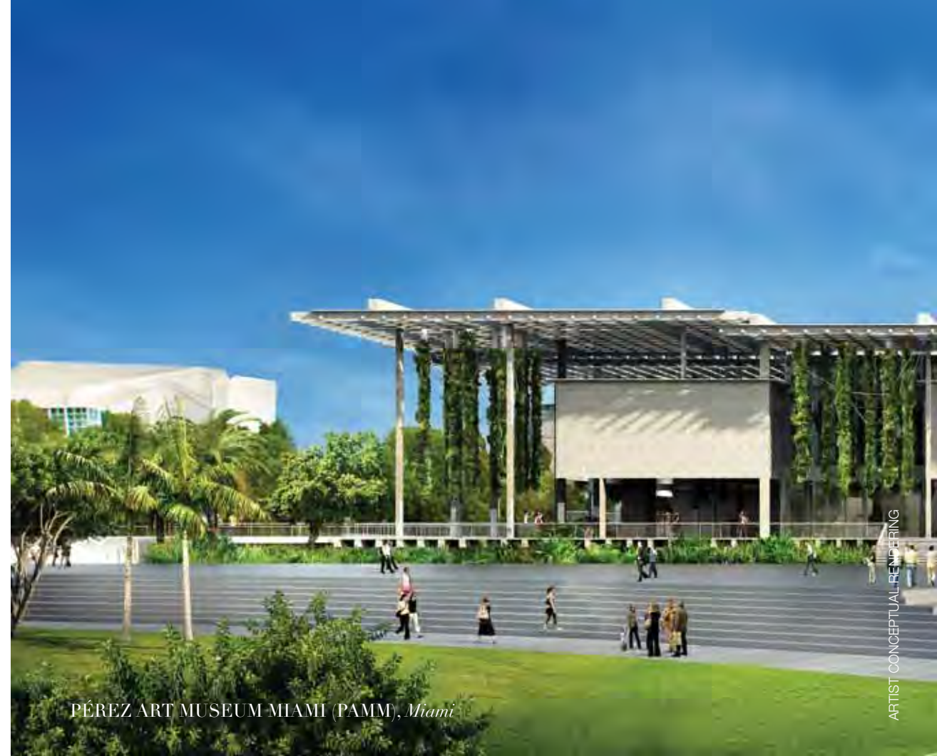
PÉREZ ART MUSEUM MIAMI (PAMM), Miami