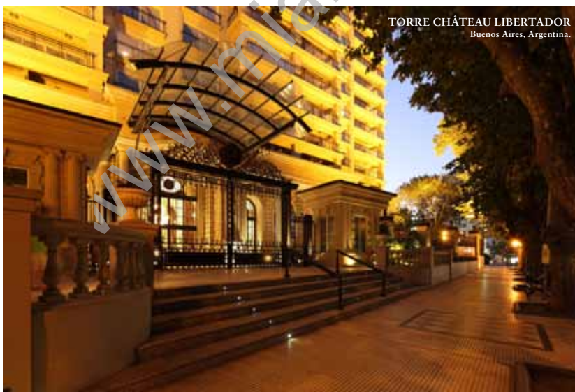
TORRE CHÂTEAU LIBERTADOR Buenos Aires, Argentina.