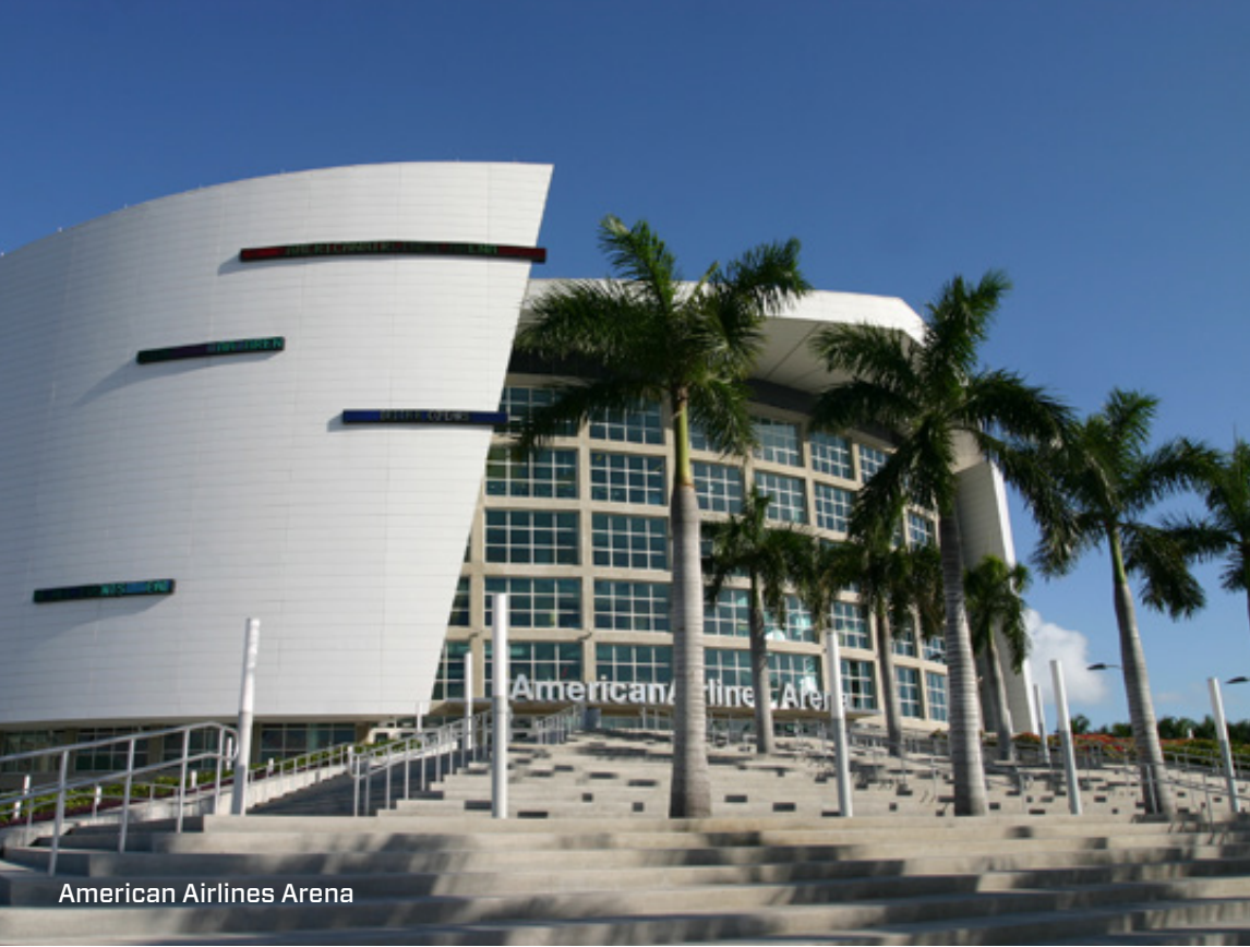
American Airlines Arena