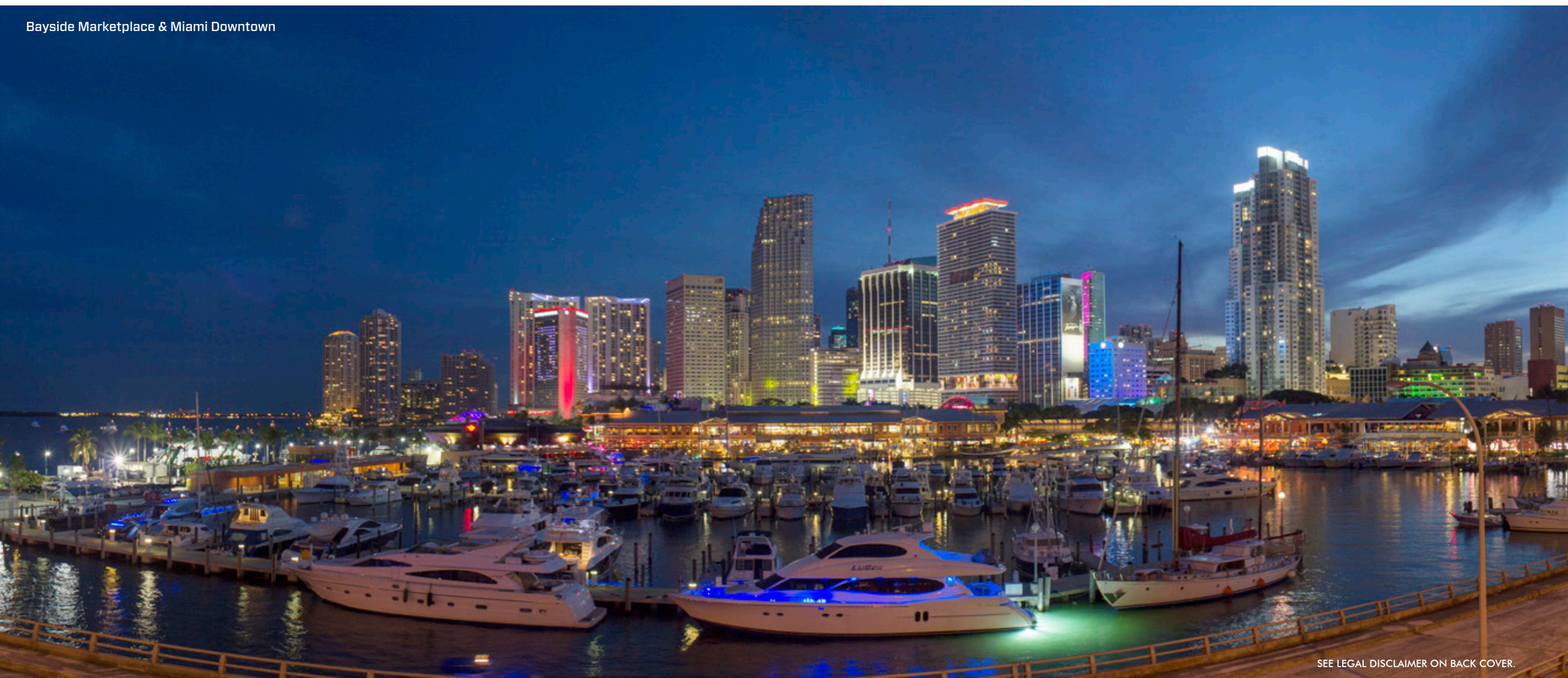
Bayside Marketplace & Miami Downtown