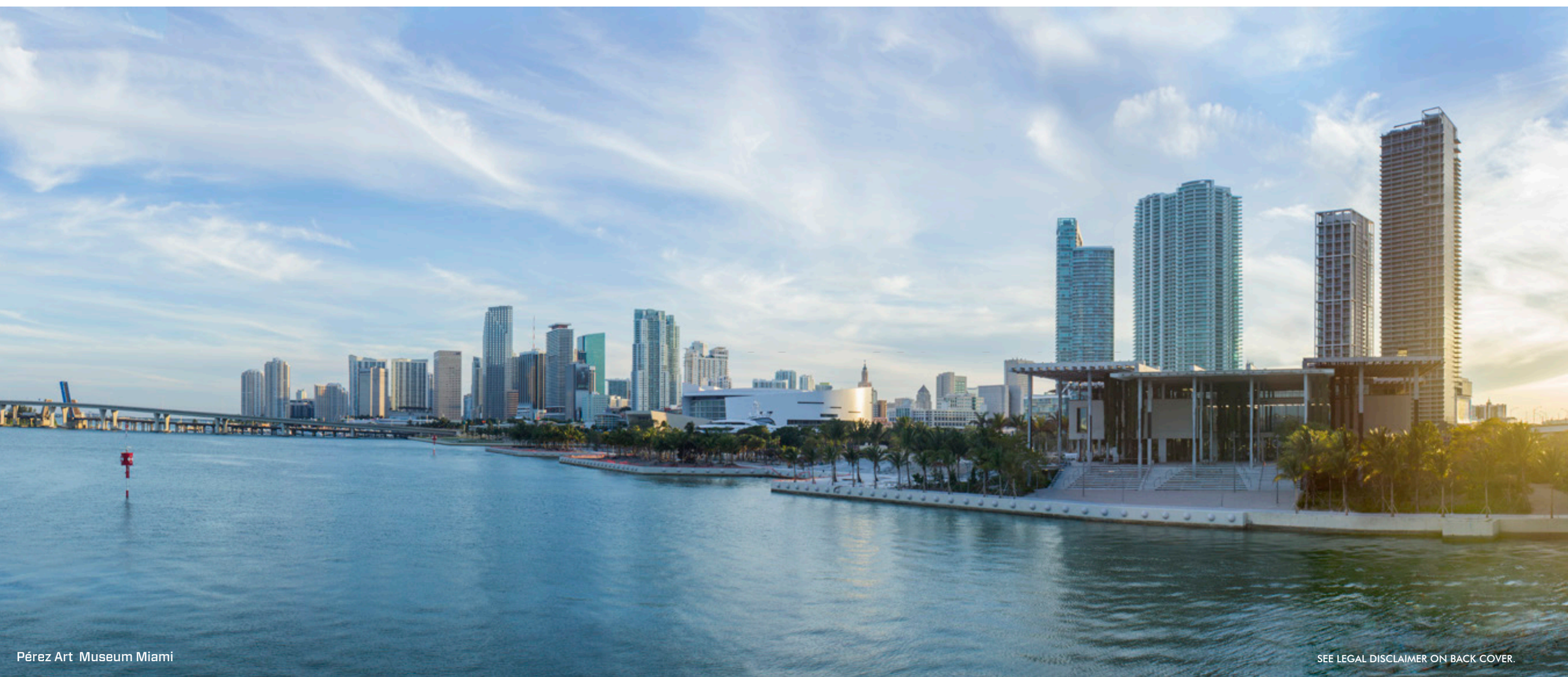
Pérez Art Museum Miami