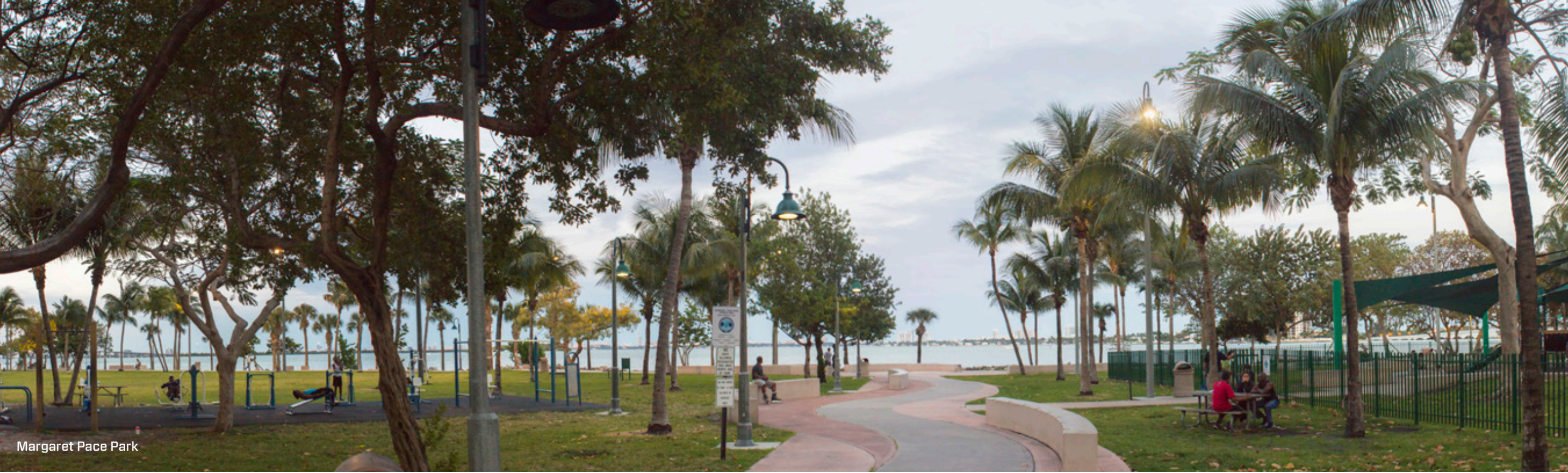
Margaret Pace Park