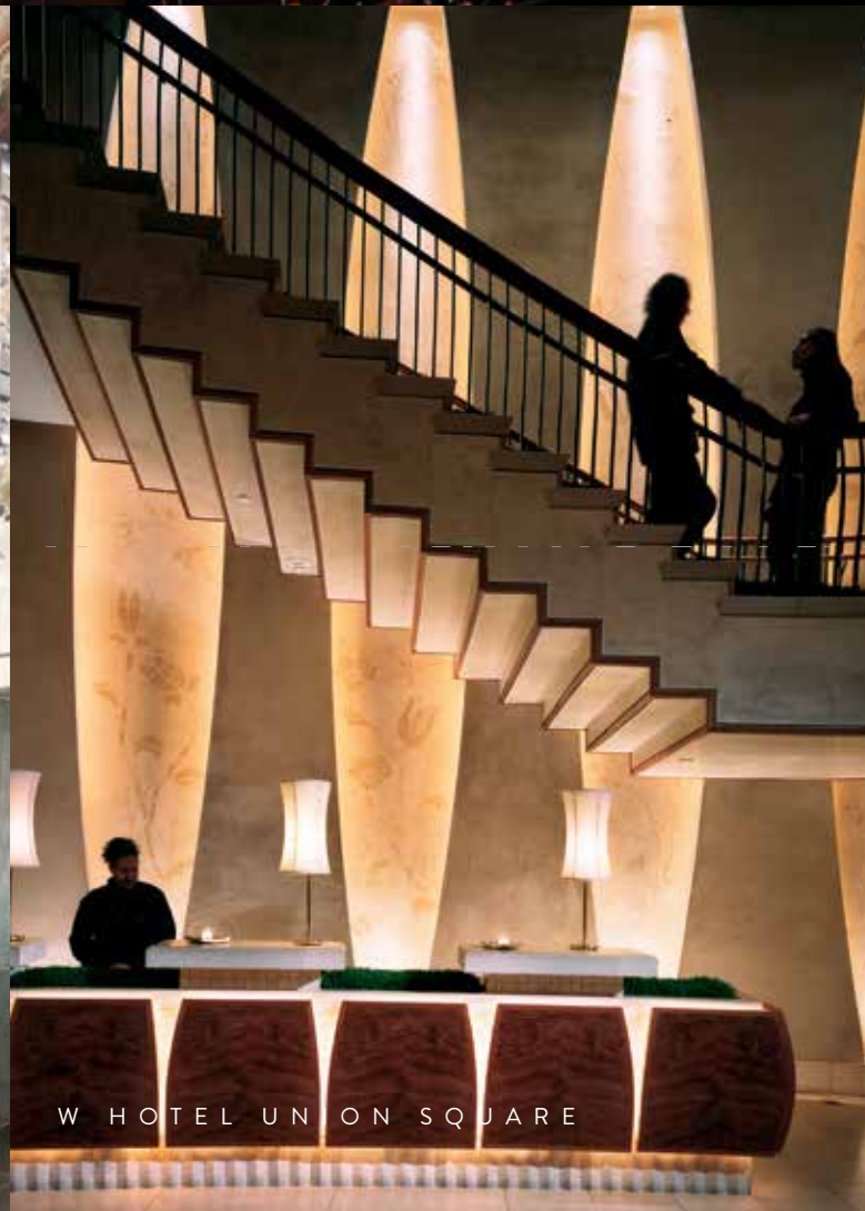
W HOTEL UNION SQUARE