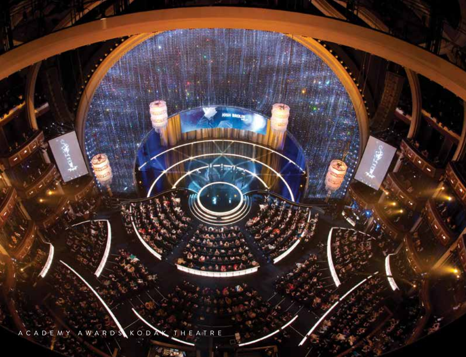
ACADEMY AWARDS KODAK THEATRE