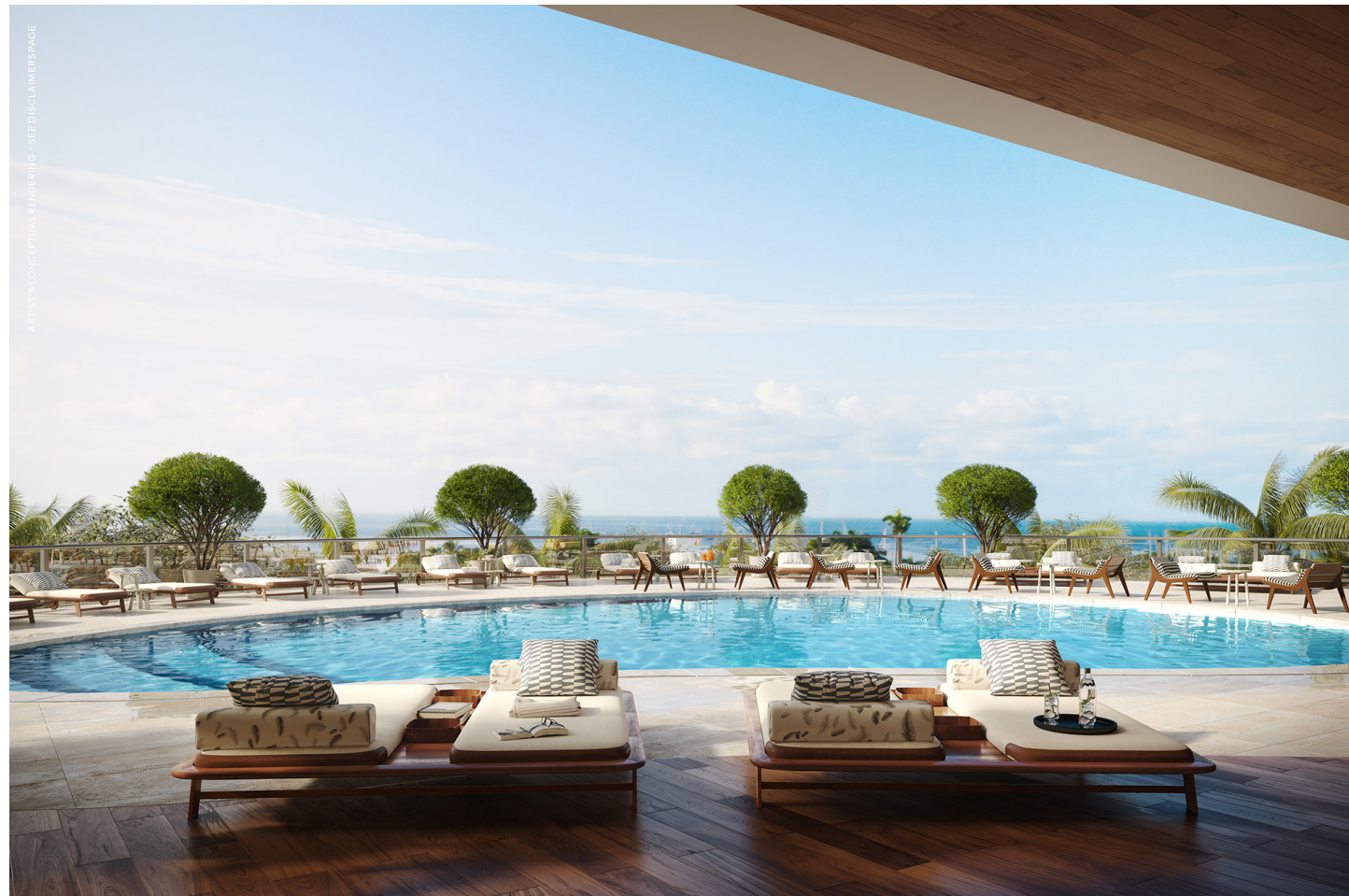
Bayshore Club Pool Deck

Personalized services, including a 24-hour concierge, are complemented by a host of amenities at Mr. C Residences Coconut Grove.