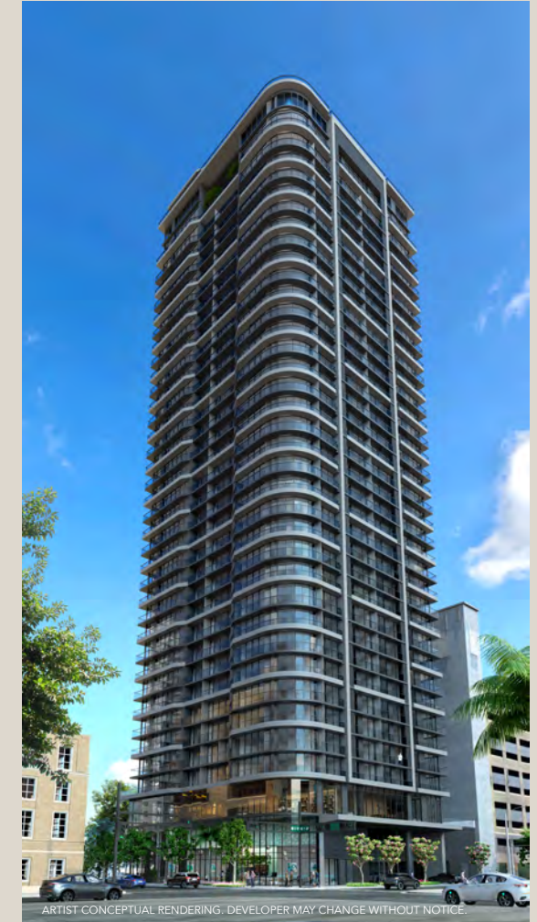
ARTIST CONCEPTUAL RENDERING. DEVELOPER MAY CHANGE WITHOUT NOTICE.