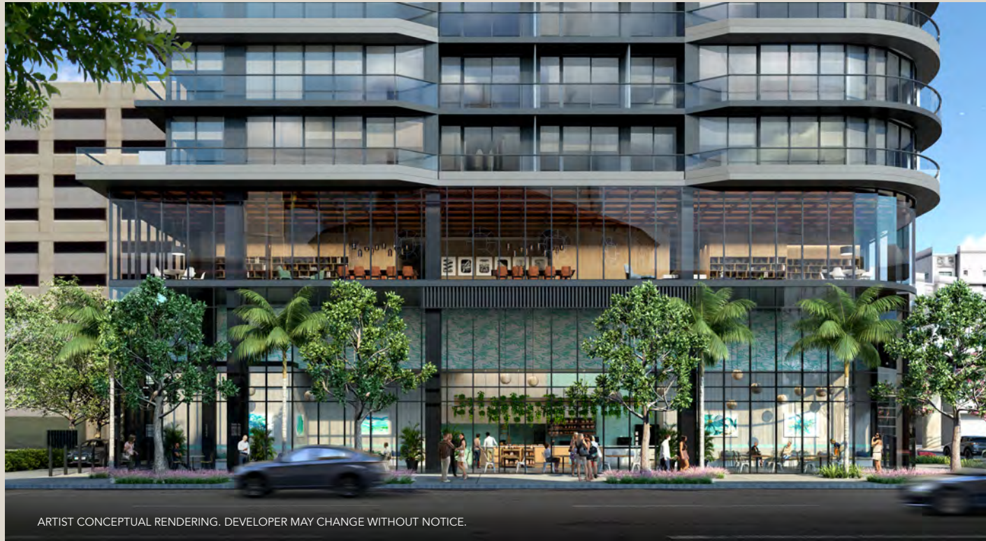
ARTIST CONCEPTUAL RENDERING. DEVELOPER MAY CHANGE WITHOUT NOTICE.