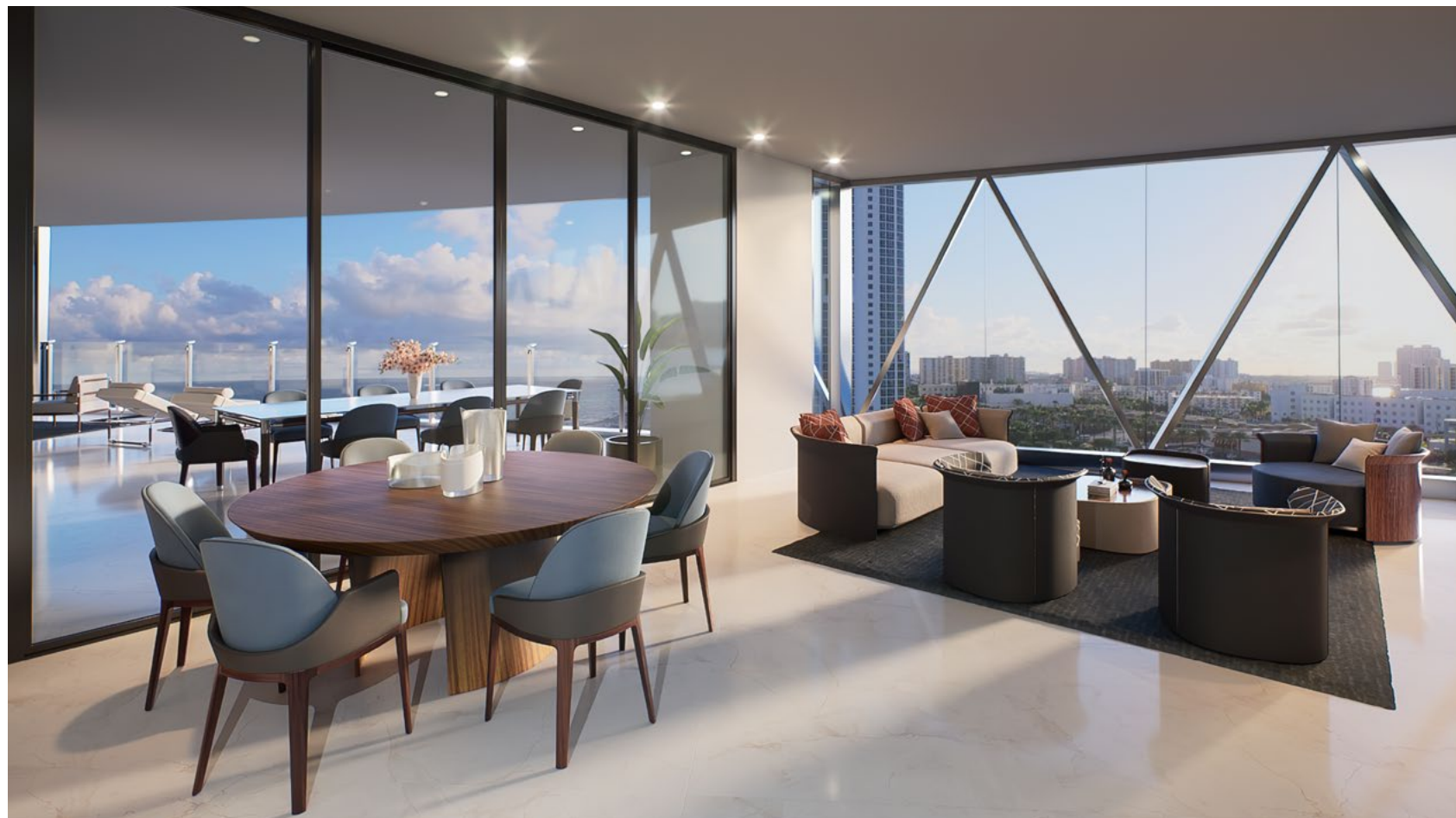
Residence Bentayga Great Room