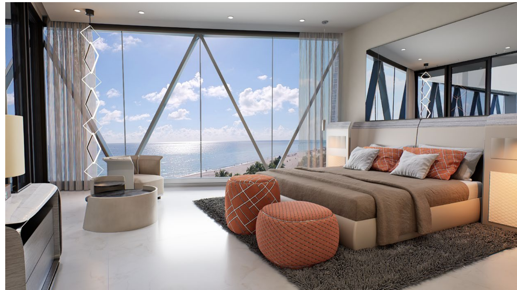
Residence Azure Master Bedroom