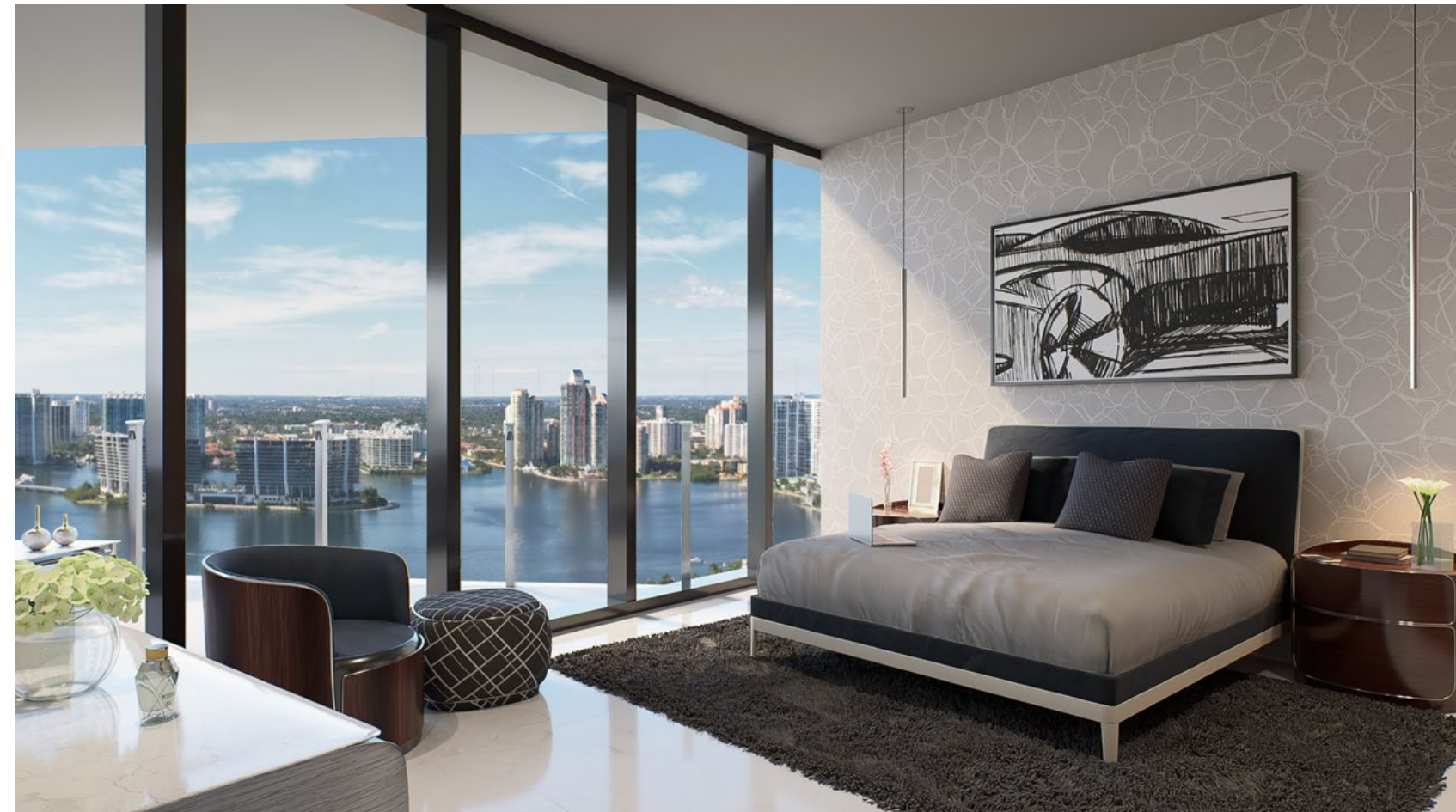
Residence Bentayga Master Bedroom