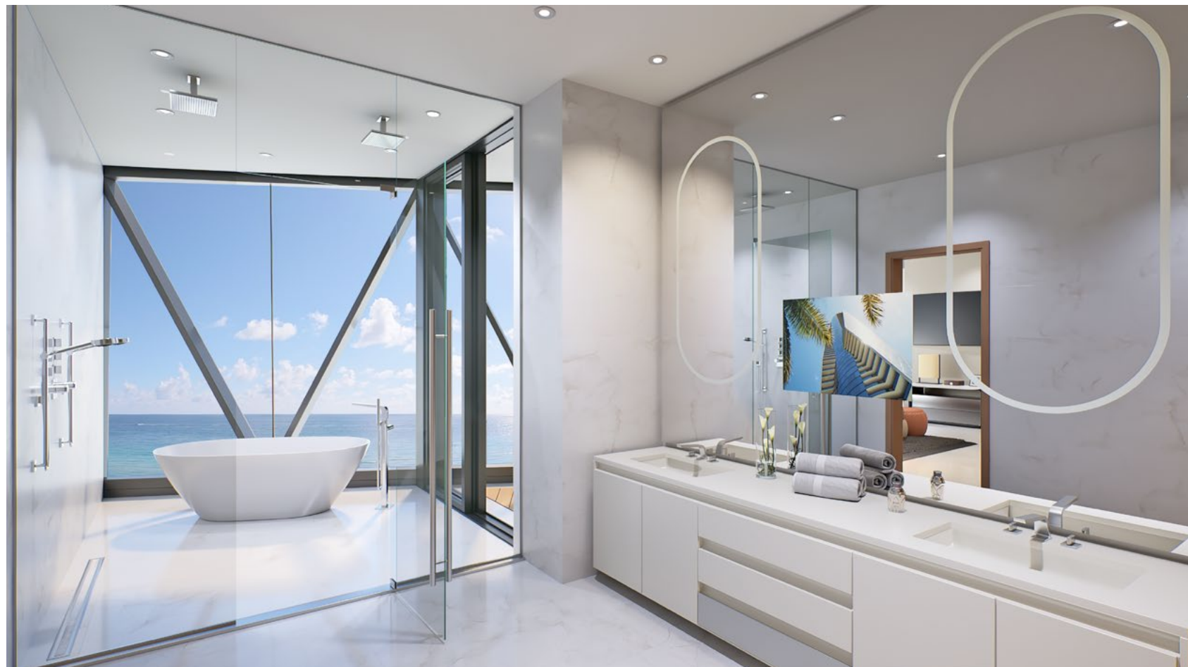
Residence Azure Master Bath