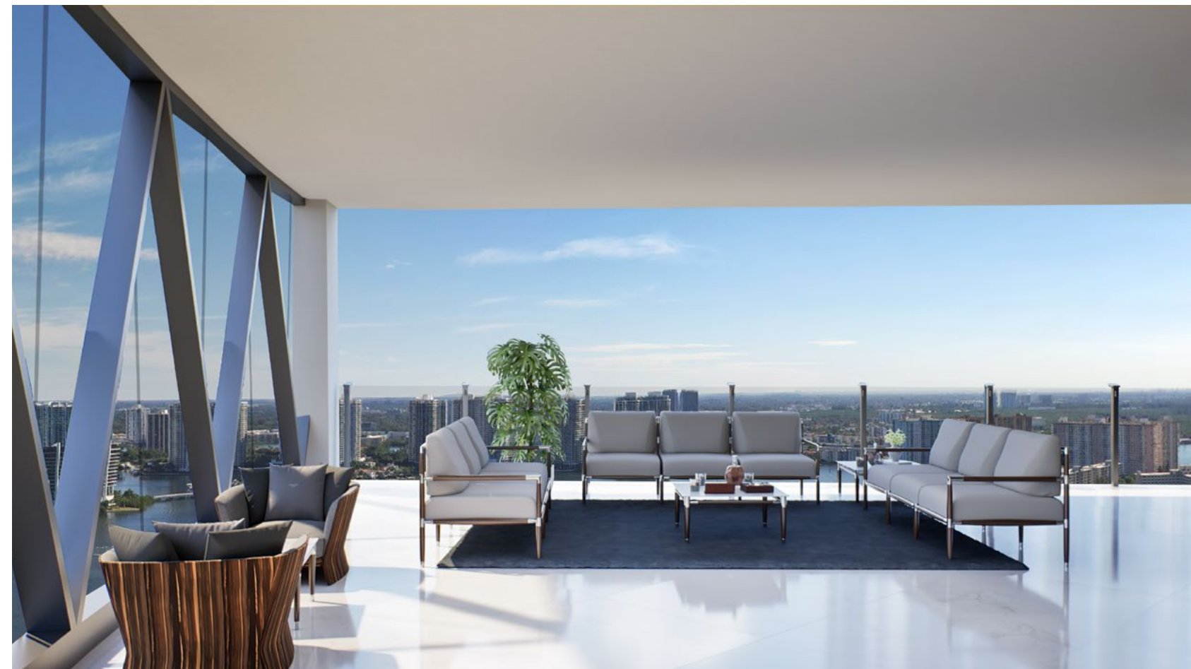
Residence Bentayga Sunset Terrace