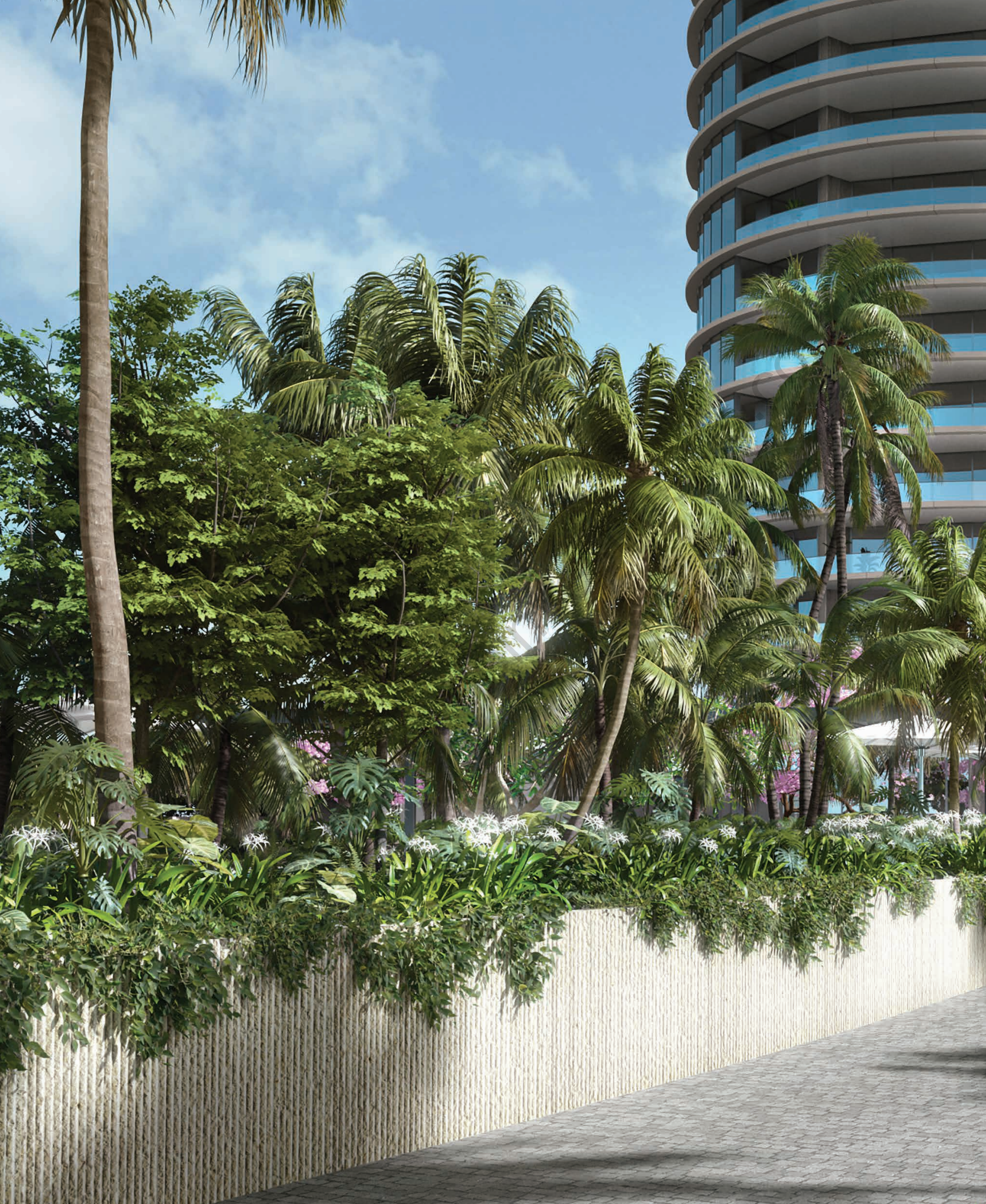
ARRIVAL FROM COLLINS AVENUE