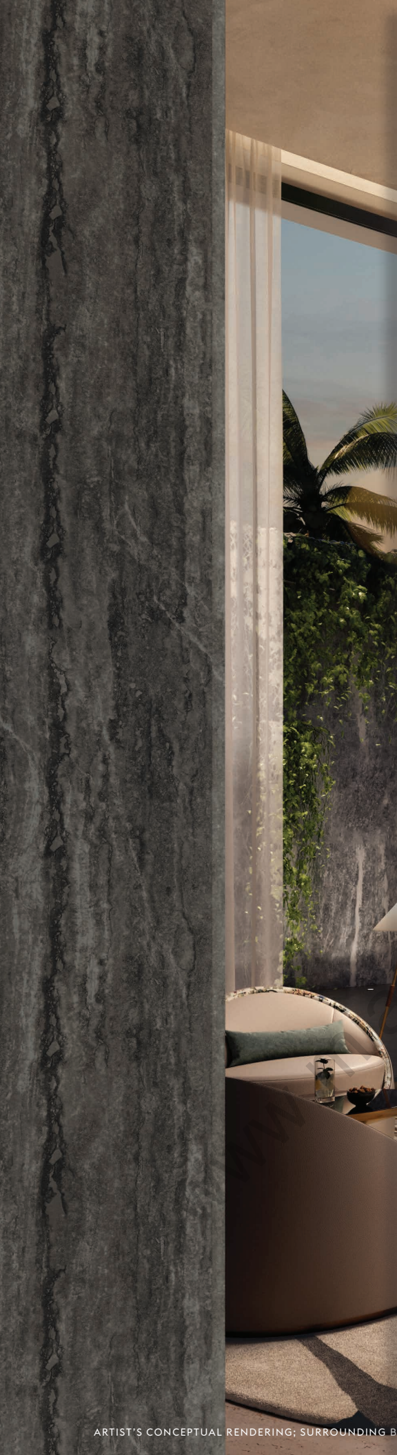
ARTIST'S CONCEPTUAL RENDERING; SURROUNDING B