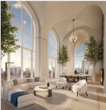
FOUR SEASONS, BOGOTÁ

Skidmore, Owings & Merrill (SOM) is a leading architecture, engineering, and planning practice responsible for some of the world's most technically and environmentally advanced buildings and public spaces—from Burj Khalifa in Dubai and One World Trade Center in New York City to Millennium Park in Chicago.