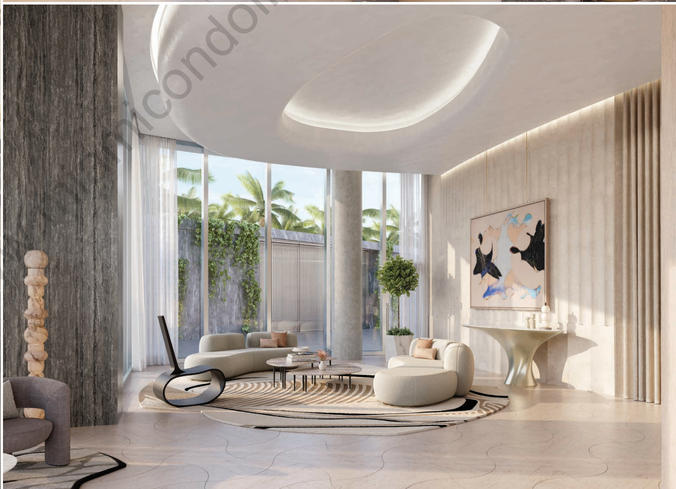
TOP: READING LOUNGE; BOTTOM: FORMAL SITTING LOUNGE