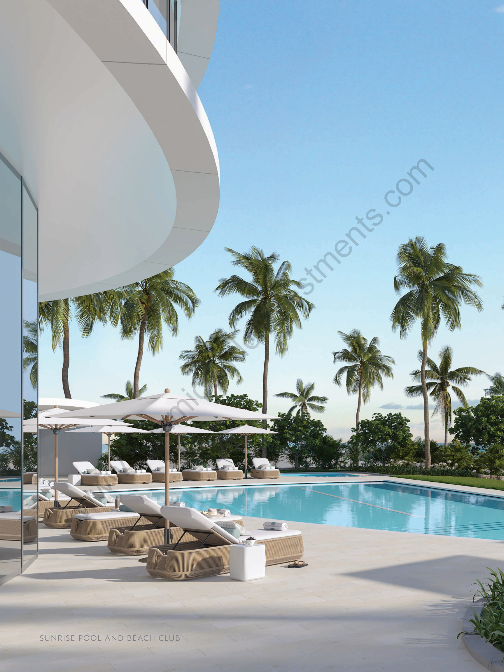
SUNRISE POOL AND BEACH CLUB