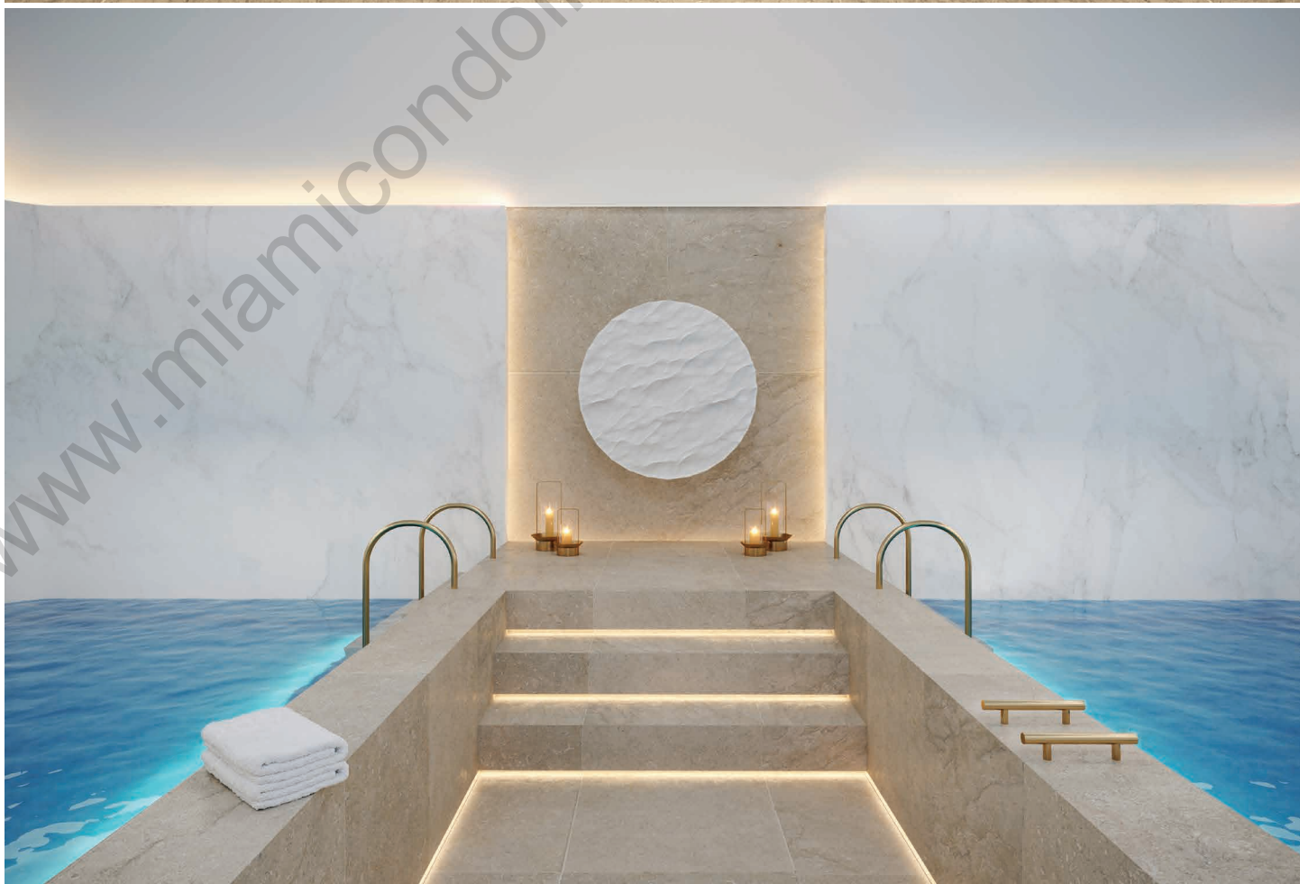
TOP: HAMMAM; BOTTOM: HOT AND COLD PLUNGE POOLS