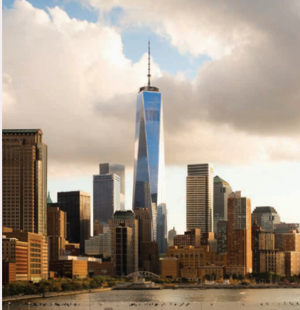
ONE WORLD TRADE CENTER, NEW YORK