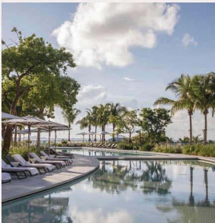
PARK GROVE, MIAMI