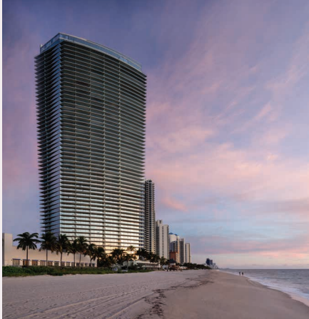
RESIDENCES BY ARMANI CASA, SUNNY ISLES