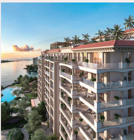
THE RESIDENCES AT 6 FISHER ISLAND, MIAMI