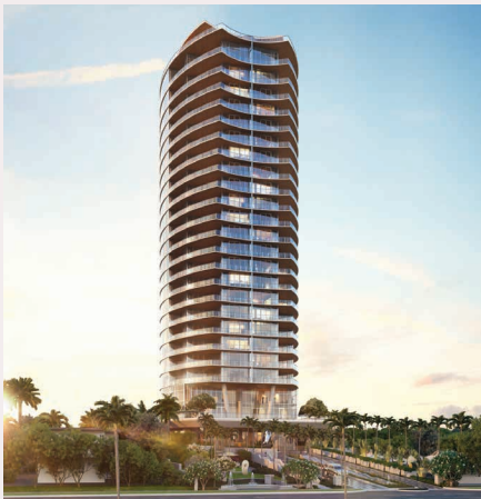
FORTÉ, WEST PALM BEACH